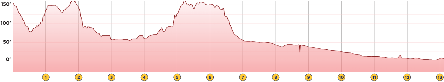
ELEVATION CHART (NOT TO SCALE)